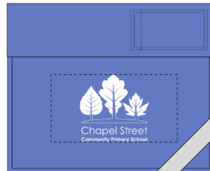
School Book Bag

Chapel Street's Active Uniform means children do not need to bring a change of clothes to school for PE; the active uniform is suitable for both learning and physical exercise.