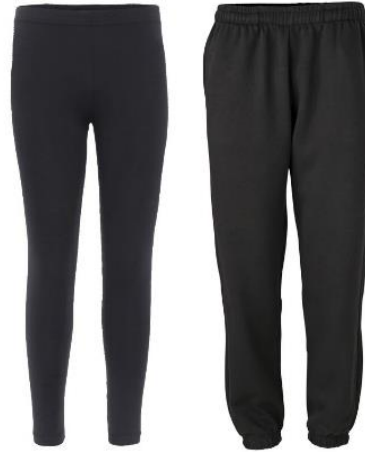
Black leggings or jog pants (plain no logo)