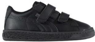
Plain black trainers (no logo)