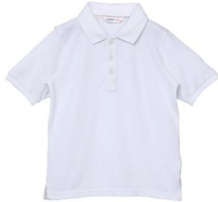
White Air-Tex T-Shirt