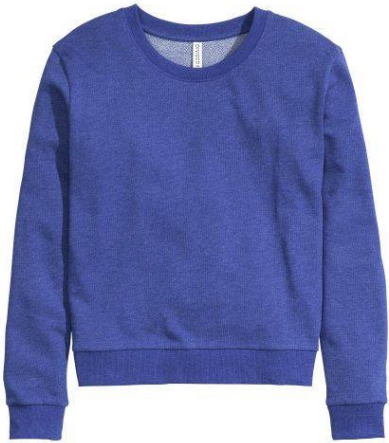
Blue Sweatshirt (no logo)