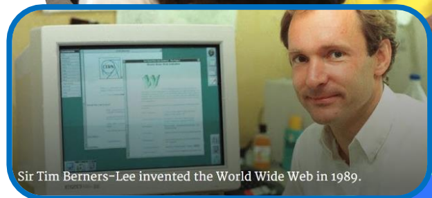
Sir Tim Berners-Lee invented the World Wide Web in 1989.