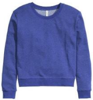
Blue Sweatshirt (no logo)