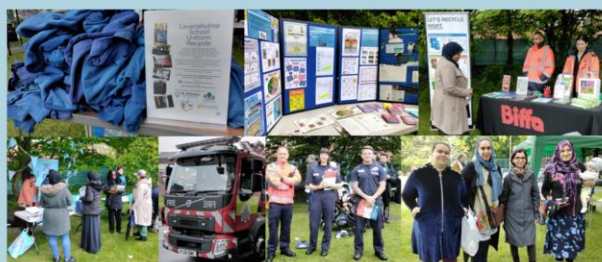
Parents, families, neighbours, Levenshulme Community - everyone is welcome!