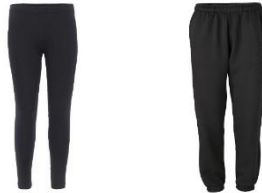
Black leggings or jog pants (plain no logo)